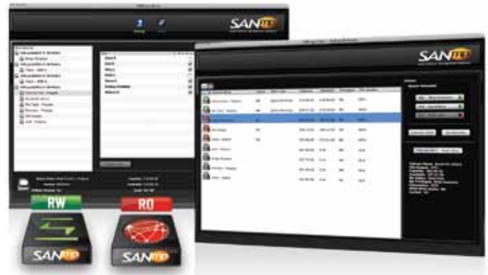
Share Fibre Channel and iSCSI storage. Requires no metadata controllers.

Now also available – iSANmp, an iSCSI-only version of SANmp at half the price.